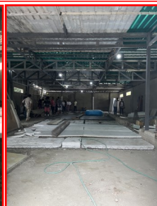
The laying and pouring of the floor