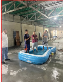
Preaching and 2 Baptisms (in our new chapel!)

Our last Sunday was filled with preaching at 2 services, meeting new members and the blessing of baptizing 2 more believers in the faith who have trusted the Lord for their salvation! The Lord has blessed our church as they continue to share the Gospel and see more people trusting in His name. We have asked the Lord of the harvest to lead us to