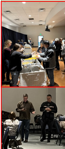
ESL Thanksgiving Dinner