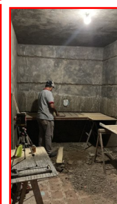
The new kitchen