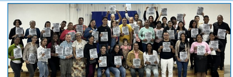
Higuero church Prayer Seminar

Every February, Venezuela celebrates Valentines (Love and Friendship) Day. For years, we have been