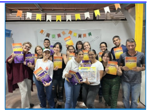
Good Soil teacher training

Finally, this month we celebrated our 18 th anniversary of the church, Grace Community Church of Caracas. It has been amazing to watch it grow and reach others with the Gospel. We give all the glory and praise to God as He works in the hearts of people to serve him! Our motto is "We are blessed to be a blessing!"