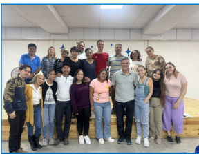
Our church leaders