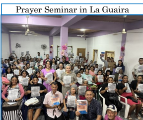
Prayer Seminar in La Guaira