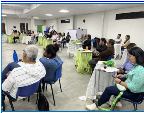
Valentine's Day Dinner