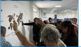
Holiday prayer walk and praying for the world!

putting on a Valentines Day dinner for the couples of our church. This year, we had a wonderful time of laughing, playing games and sharing from our hearts the Word of God. We had 20 couples come and open their hearts to allow God to continue working on their marriages!