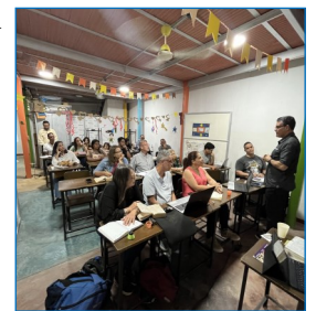
Our Bible School Missions class